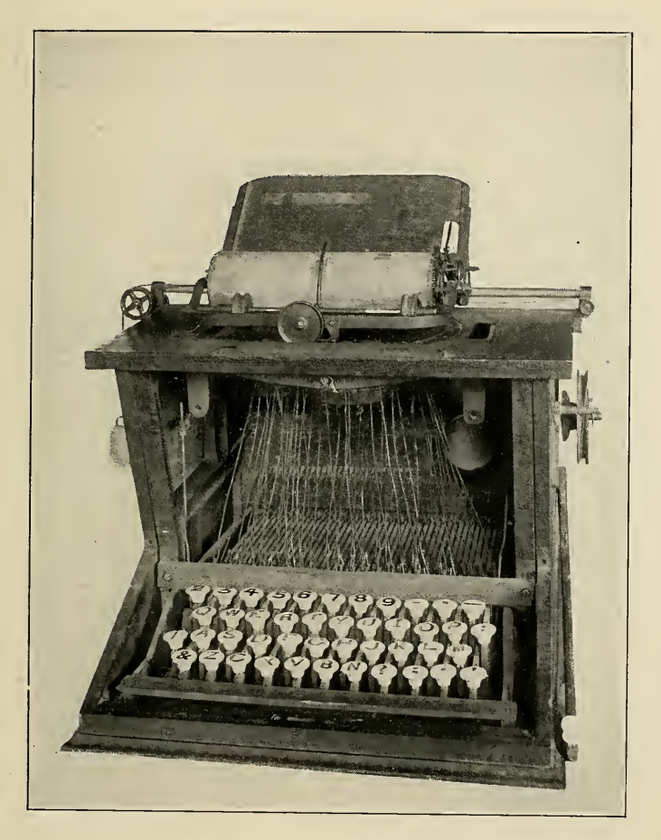
SHOLES TYPEWRITER, 1873 [Museum, Buffalo Historical Society.]